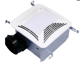
PC with PCLMK Installed