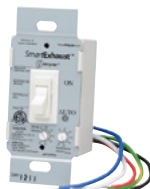
ASHRAE 62.2 Bath Fan Ventilation Controller: FT622