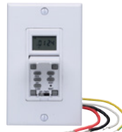
Programmable Fan Timer 24 Hour/7 Day: FT247