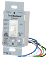
ASHRAE 62.2 Bath Fan Ventilation Controller: FT622