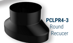
PCLPR4-3 Round Recucer

*Values shown are at .1" of static pressure