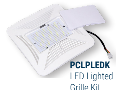
PCLPLEDK LED Lighted Grille Kit